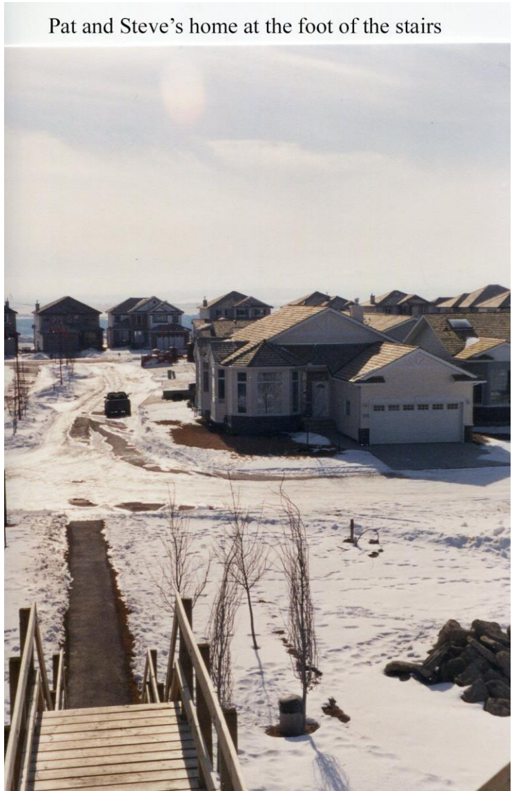
Pat and Steve's home at the foot of the stairs

In 1999 we were looking for a new home because Steve's mother June was moving from Toronto to live with us. We toured most of the condos in every sector of Calgary until we came across Mapleland's Villas of Rocky Ridge Ranch, a new area of the city. The units were not cookie-cutters (one unit looking exactly like the rest), lots of space between duplexes, lots of trees and land, and a good choice of floor plans. Also, a bus stop was very close, and we had quick access to the mountains. Most of the units at the front entrance were already purchased, and one duplex on east side was a show home. At first, we chose the last lot at